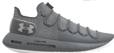
3020618 // 101 GPH/STL